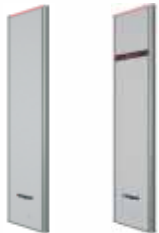
standard with integrated wireless people counter