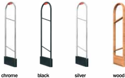
chrome black silver wood